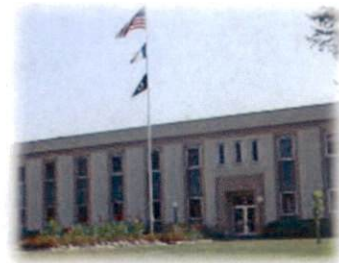
CEDAR COUNTY, IOWA

CEDAR COUNTY BOARD OF SUPERVISORS Cedar County Courthouse 400 Cedar Street, Tipton, IA 52772 Tel 563-886-3168 Fax 563-886-3339 bos@cedarcounty.iowa.gov www.cedarcounty.iowa.gov